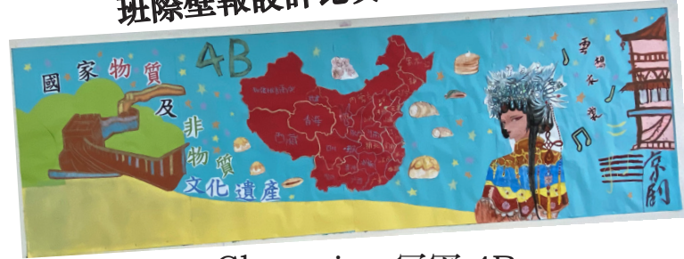
Champion 冠軍 4B