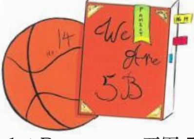
1st Runner up 亞軍 5B

Inter-class Board Decoration Competition 2 班際壁報設計比賽(下學期)