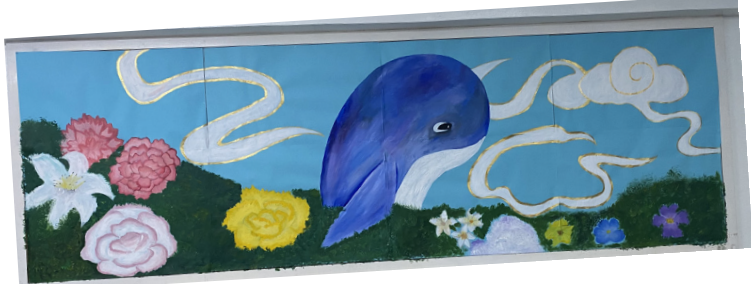
1st Runner up 亞軍 5C

Inter-class Board Decoration Competition 2 班際壁報設計比賽(下學期)