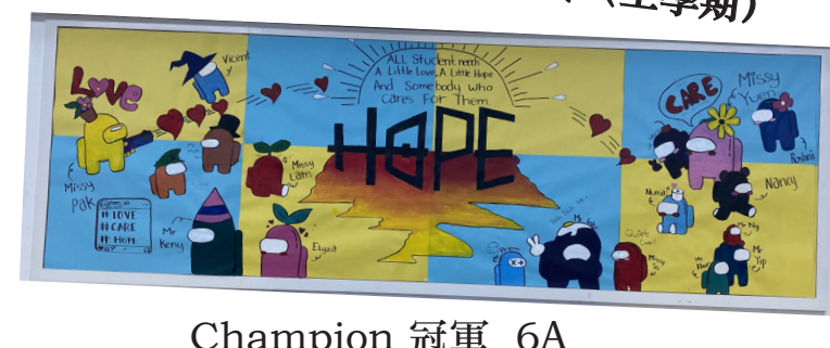
Champion 冠軍 6A

Inter-class Board Decoration Competition 1 班際壁報設計比賽(上學期)